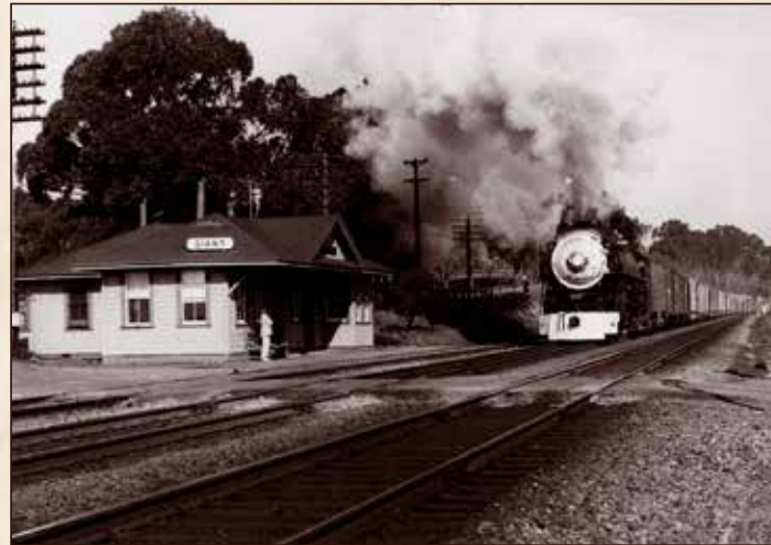
An Oakland-bound Southern Pacific steam locomotive thunders past the Atlas Powder Company's Giant train station at Point Pinole.

Much has changed since then, but the land has come full circle, returning to calm after years of noisy industry. Explore it and discover traces of the past.